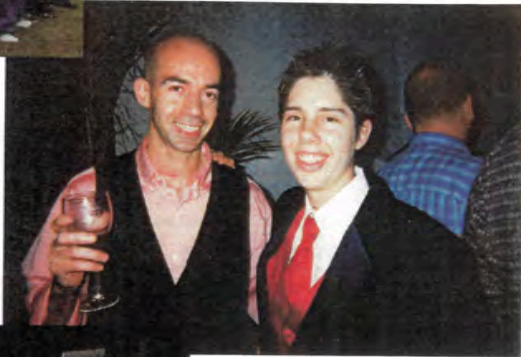
2nd Annual GAYla —April 2004