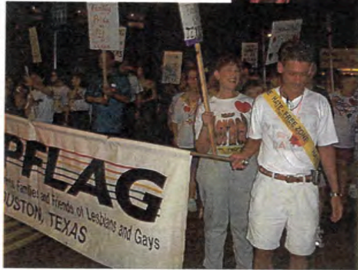
Houston Gay Pride March—June 2004

A Directory of Gay, Lesbian, Bisexual, and Transgender Friendly Businesses/ Resources in the Brazos Valley