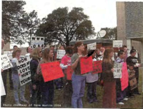
"First Comes Love, Then Comes Marriage". Marriage Equity Rally at Brazos Valley Courthouse— Feb 2004